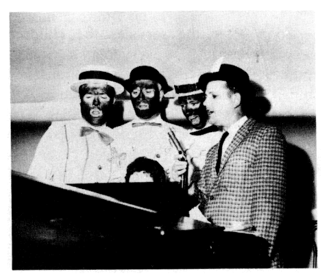
How did that white man get in here?