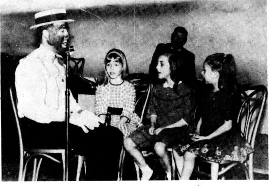
Now, all together, sing!