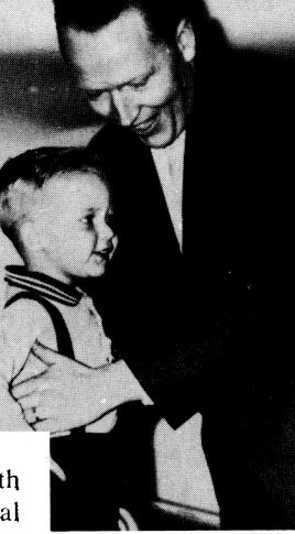
Don't sing, Charlie McCarthy, until I pull the string!

We thank the cheerleaders and our "hard working" band for for a wonderful season and appreciate the great Christian sportsmanship, driving hustle, good losers and church support of all.