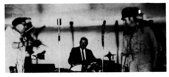
Picasso and Rembrandt never had it so good!