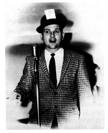
Don't sneak up behind me like that.